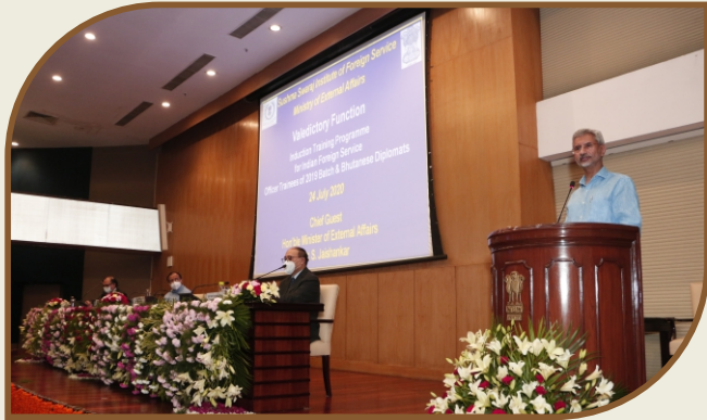
EAM addressing the IFS OTs

A valedictory ceremony was organized on 24 July 2020, which was presided over by Dr. S. Jaishankar, Hon'ble External Affairs Minister (EAM) as Chief Guest. Shri V. Muraleedharan, Hon'ble Minister of State for External Affairs (MoS) and Shri Harsh V. Shringla, Foreign Secretary participated as Guests of Honour. Awards were given on the occasion to deserving OTs of the 2019 batch.