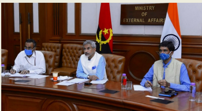
MoU with Angola signed on the margins of 1 st India-Angola Joint Commission Meeting