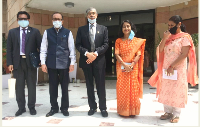
H.E. Mr. Muhammad Imran, High Commissioner of Bangladesh to India visited SSIFS to discuss bilateral issues of cooperation and training related matters.