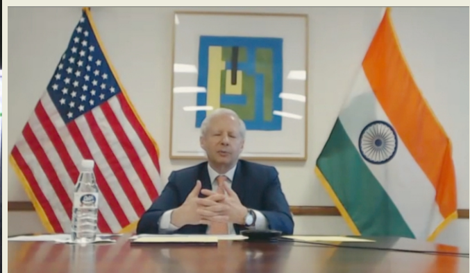
▼ H.E. Mr. Kenneth I. Juster, Ambassador of US to India interacted on webinar with the IFS OTs