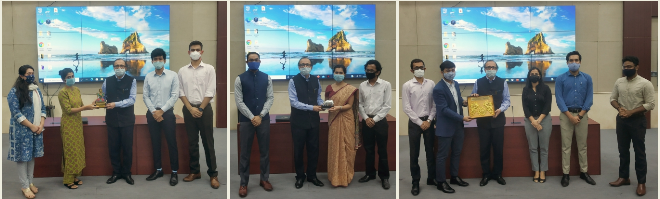
IFS OTs handover insignias to Dean (SSIFS) which were received by the respective groups during their Army Attachments