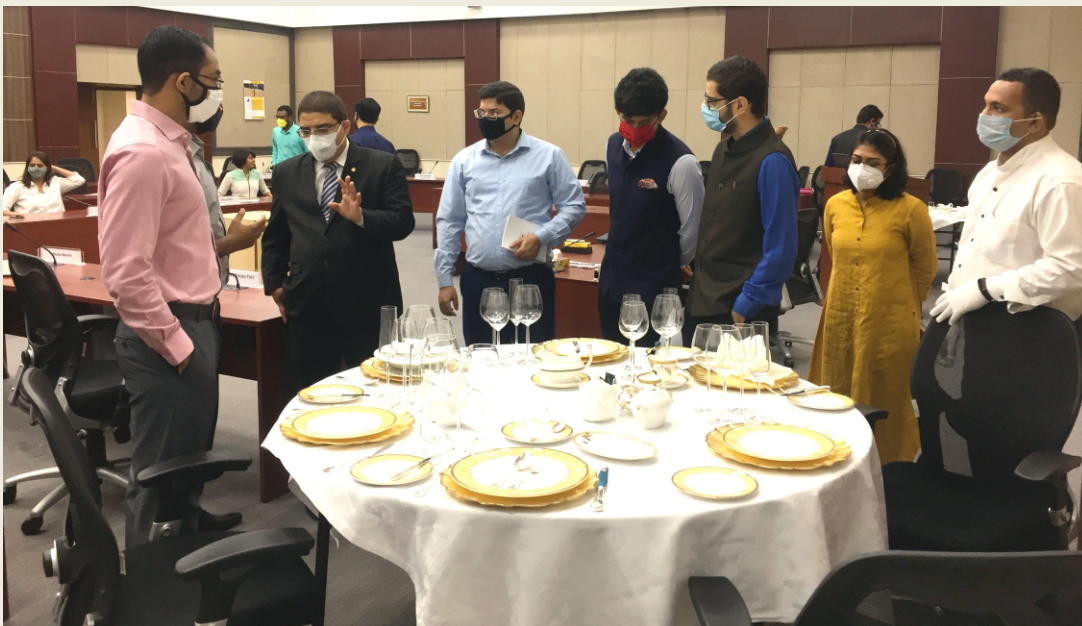
'Workshop on Hospitality' for the IFS OTs conducted at Hotel Taj Palace, New Delhi