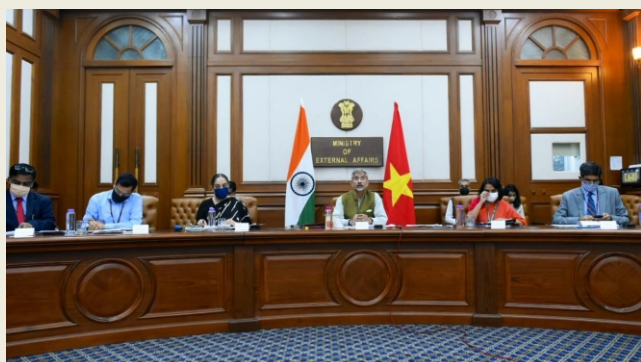
MoU with Vietnam signed on the margins of 17 th India-Vietnam Joint Commission Meeting