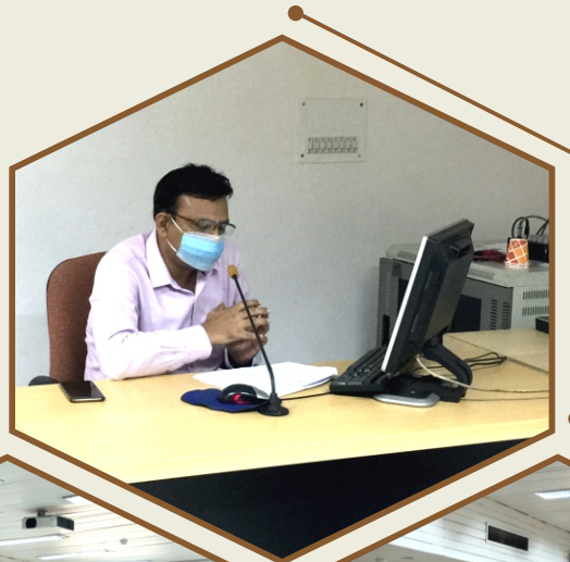
Speaker addressing on webinar to participants of the Promotion-related Training Programme