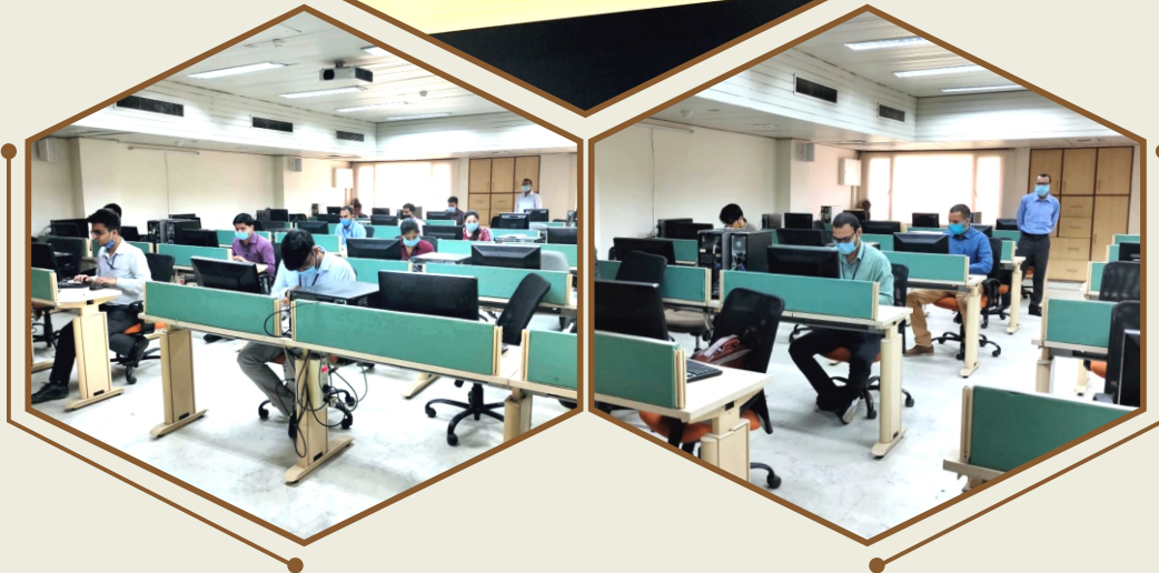
English Stenography Test for PAs & Stenos in progress